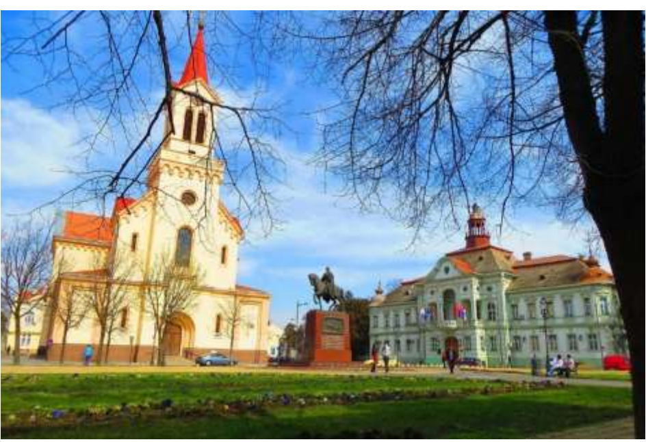
Square of Freedom