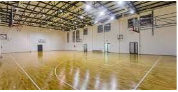
More information about Competition venues will be published in Bulletin 2